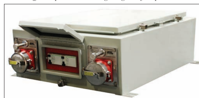
ESL now offers receptacles with an integrated ground fault protection device

There are some issues to resolve, such as how to make sure reefers are connected to the correct plug for the stack slot, but ESL says the system has the potential to save a great deal of equipment damage. □