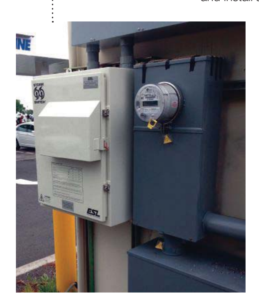
Figure 1: An MTS provides the means for a portable generator to deliver emergency backup power to a gas station if the utility fails.

now storms, high winds, and heavy rain can shut down restaurants, banks, gas stations, and grocery stores for prolonged periods of time (see Figure 1). When these businesses have to close their doors-even for a day-their owners can lose big, in both sales and reputation.