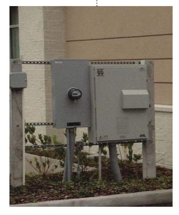
Figure 3: A banking institution has emergency backup power protection via an MTS that connects to a portable generator.