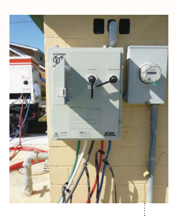
Figure 2: With the help of a portable generator, this MTS provides emergency backup power to a business.

While there are many things to consider when installing a backup power system, one thing is certain: businesses will definitely feel the impact when power is lost for an extended period of time. "The reliability of the electrical grid in the U.S. is being called into question more often," Hellm-